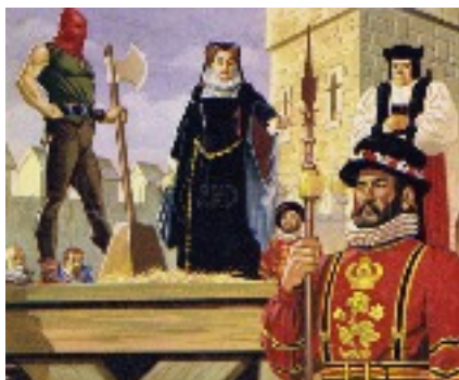
Mary Stuart executed by Elizabeth I 1587