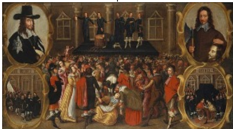
Charles I publicly executed at the White hall Palace 01/1649