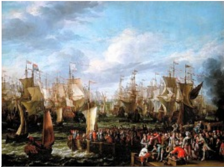
William of Orange invaded England call Glorious Revolution. 11/1688