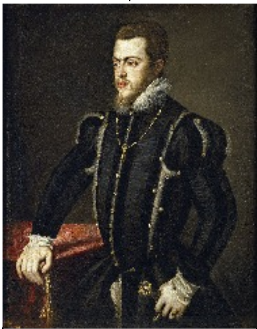
(Aug.) Philip of Spain tried to invade England but he failed 1588