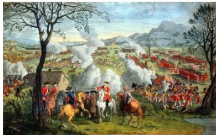
Battle of Culloden 1746