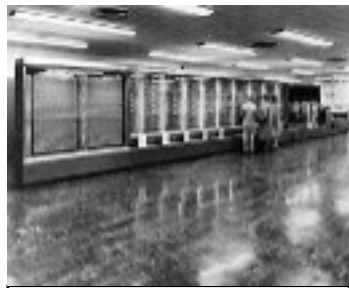
Mark 1 1943