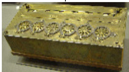
La pascaline 1642