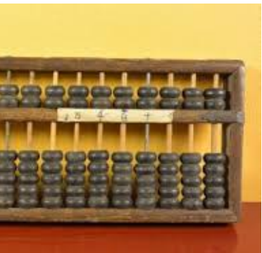
boulrier 3000 av J.C.