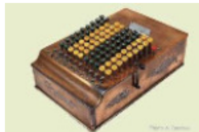
1er calculateur a clavier 1885