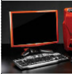
Ordinateur de nos jours 2000