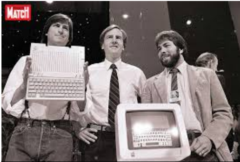
1er d'apple computer personnel 1975