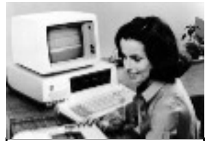
le 1er pc 1981