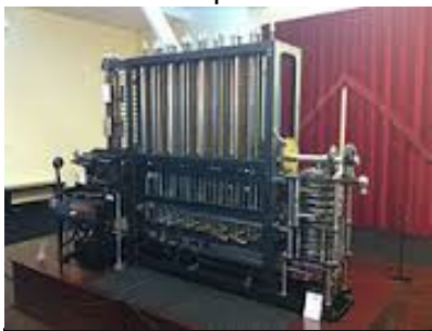
Machine à calculer de Charles Babbage 1834