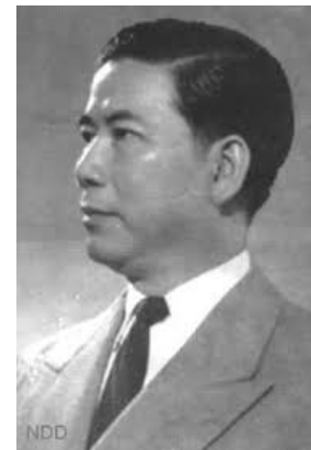
NGO DIHN DIEM