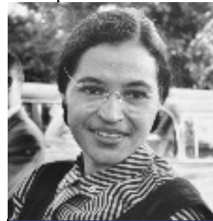
Rosa Parks is arrested 1955