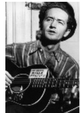
"This Land is your Land" by Woody Guthrie 1933