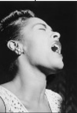
"Strange Fruit" by Billie Holliday 1939

The haunting rendition by Billie Holliday is a chilling reminder of the innumerable struggles that African Americans faced in the years following Reconstruction.