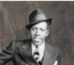
"Sweet Home Chicago" by Robert Johnson 1936