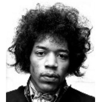
"Machine Gun" by Jimi Hendrix 1970