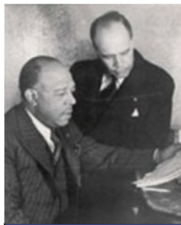
"Black National Anthem" by James W. and John R. Johnson 1900