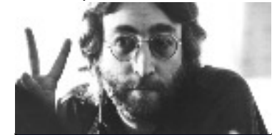
"Give Peace a Chance" by John Lennon 1969