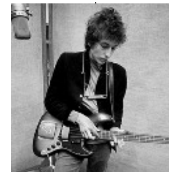
"Masters of War" by Bob Dylan 1963