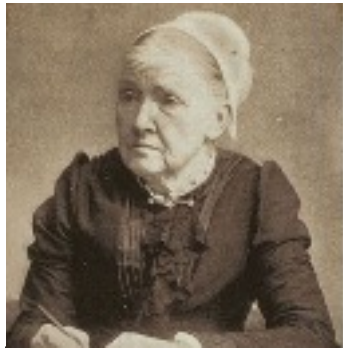
Julia Ward Howe wrote "The Battle Hymn of the Republic" 1862

ownership. Protest songs against slavery, and to promote women's suffrage and temperance.